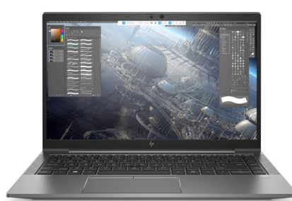
HP ZBook Firefly 14 G7 Mobile Workstation 207W1PA + 207W6PA