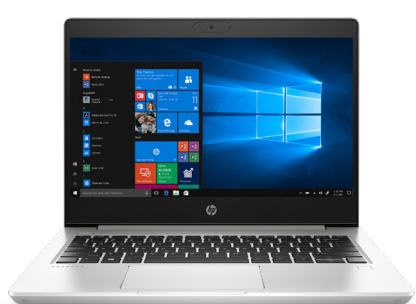
HP ProBook 430 G7 13.3" Laptop 9UQ45PA + UK703E

For the best possible learning experiences for students right across NZ, we've determined these models are the most suitable and great value.